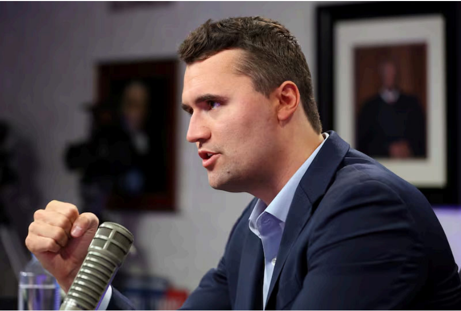
Charlie Kirk, Turning Point USA founder and president, answers interview questions on the set of The Charlie Kirk Show at Turning Point headquarters in Phoenix, Ariz., on Tuesday, Aug. 19, 2025.